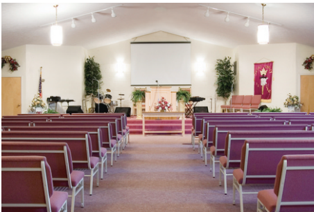
Houses of worship